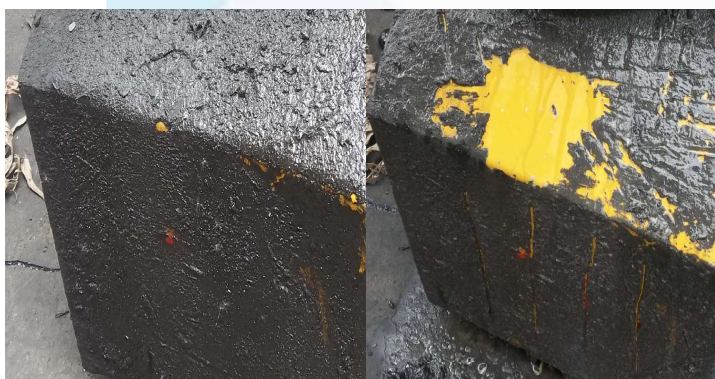
Star Clean Before-After Cleaning Demonstration