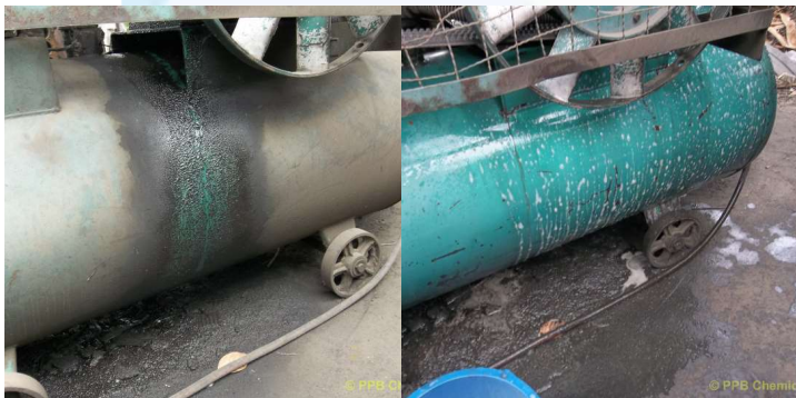
Star Clean Before-After Cleaning Demonstration